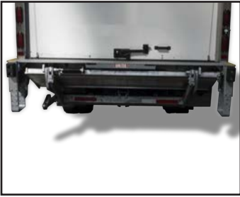
EM Series Gate in stowed position.