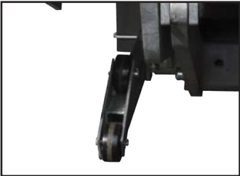
Bolt-on Parting Bar shown above.