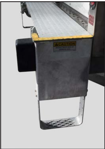
Optional Galvanized Single Step Dock Bumper with Bumper Block.